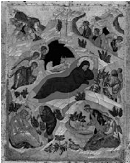
Have a blessed Holy Nativity!